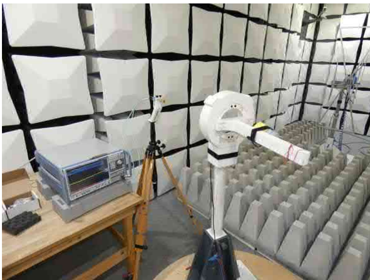
Photo 2-3: Test setup for radiated measurements (fully anechoic chamber, CFR 47 Part 15, Subpart C, §256)