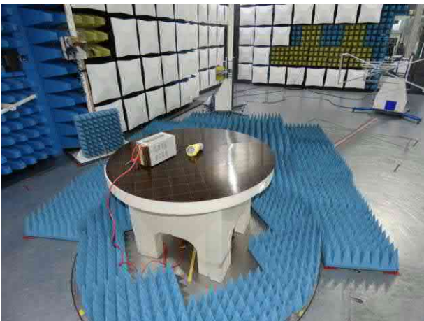
Photo 8-10: Test setup for radiated measurements (semi anechoic chamber, CFR 47 Part 15, Subpart B)