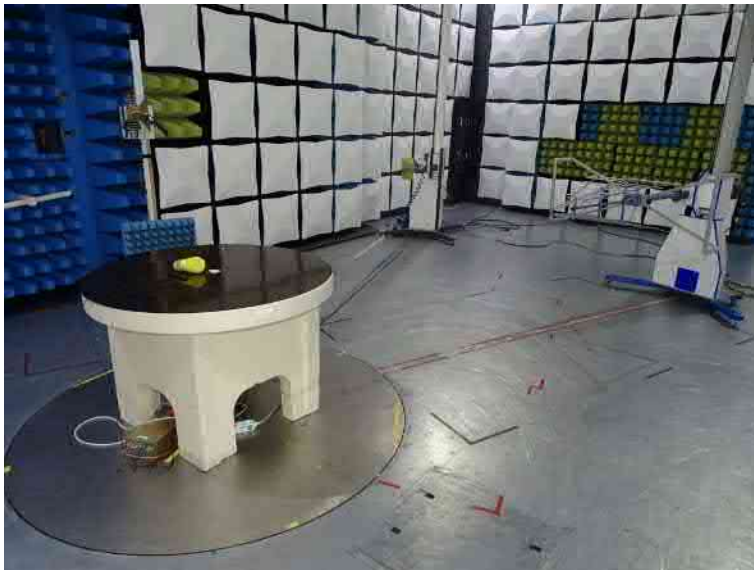
Photo 5: Test setup for radiated measurements (semi anechoic chamber, CFR 47 Part 15, Subpart C, §247)