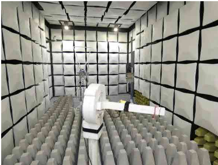
Photo 6-7: Test setup for radiated measurements (fully anechoic chamber, CFR 47 Part 15, Subpart B)