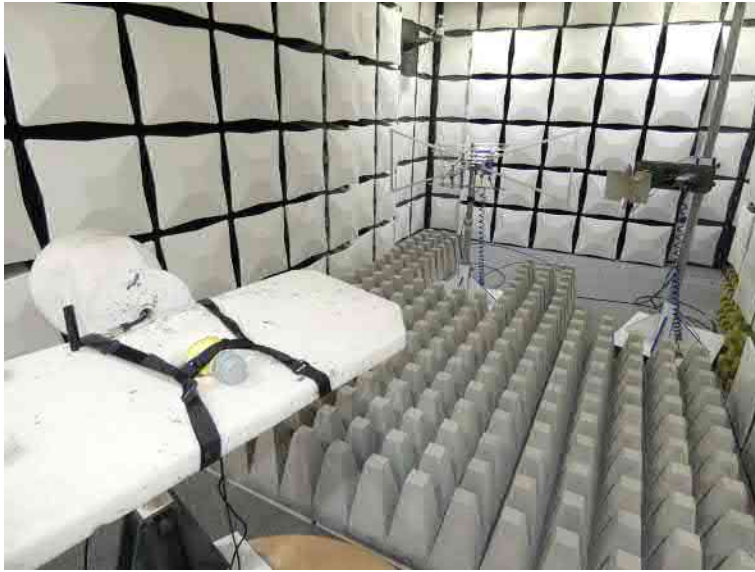
Photo 1: Test setup for radiated measurements (fully anechoic chamber, CFR 47 Part 15, Subpart C, §247)