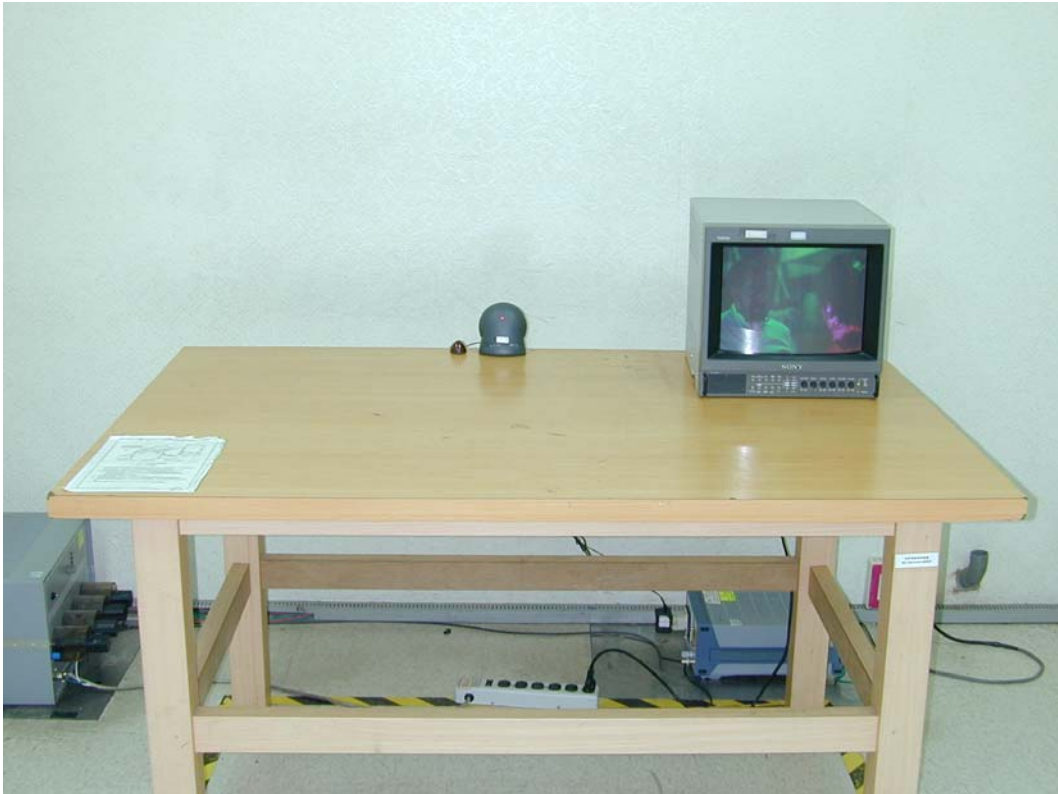
Back View of Conducted Test (Adapter: AHEAD)