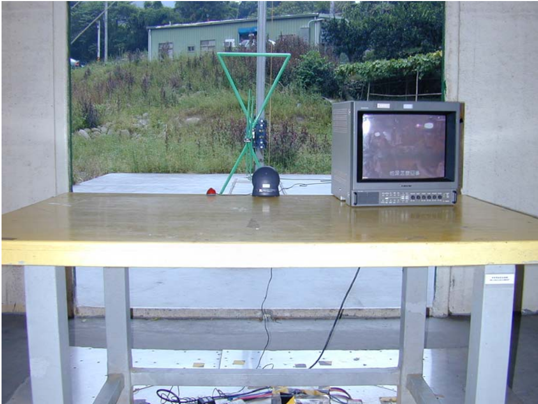
Back View of Radiated Test (Adapter: AC adapter)