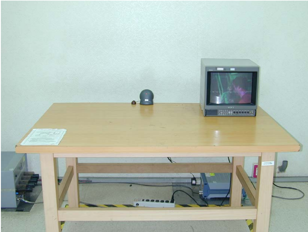
Back View of Conducted Test (Adapter: AC adapter)