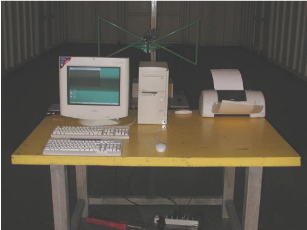
Back View of Radiated Test