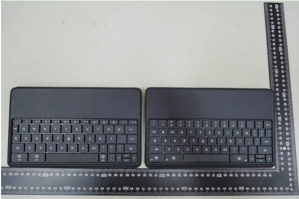
Front View of EUT - 1