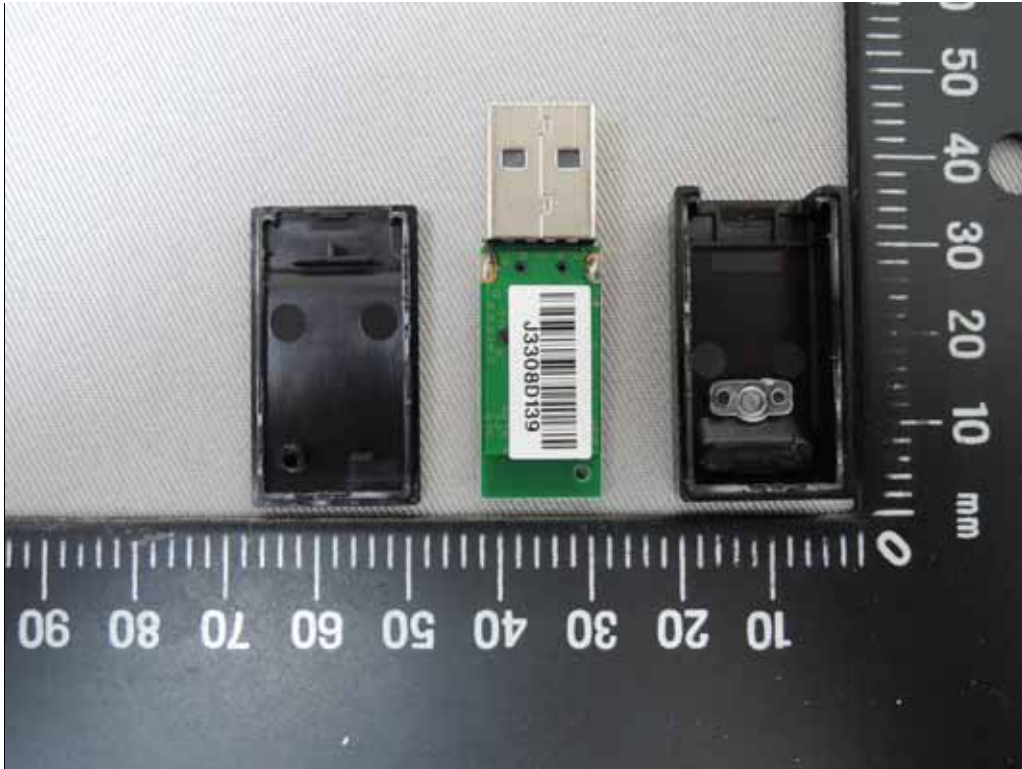
Open View of EUT-2