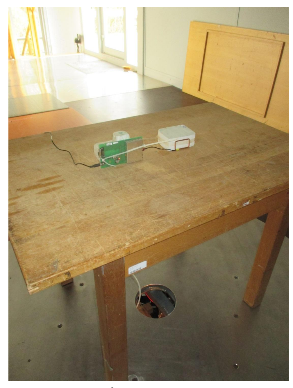
153615_3.JPG: Test setup open area test site

Examiner: Manuel BASTERT Date of issue: 05/16/2017