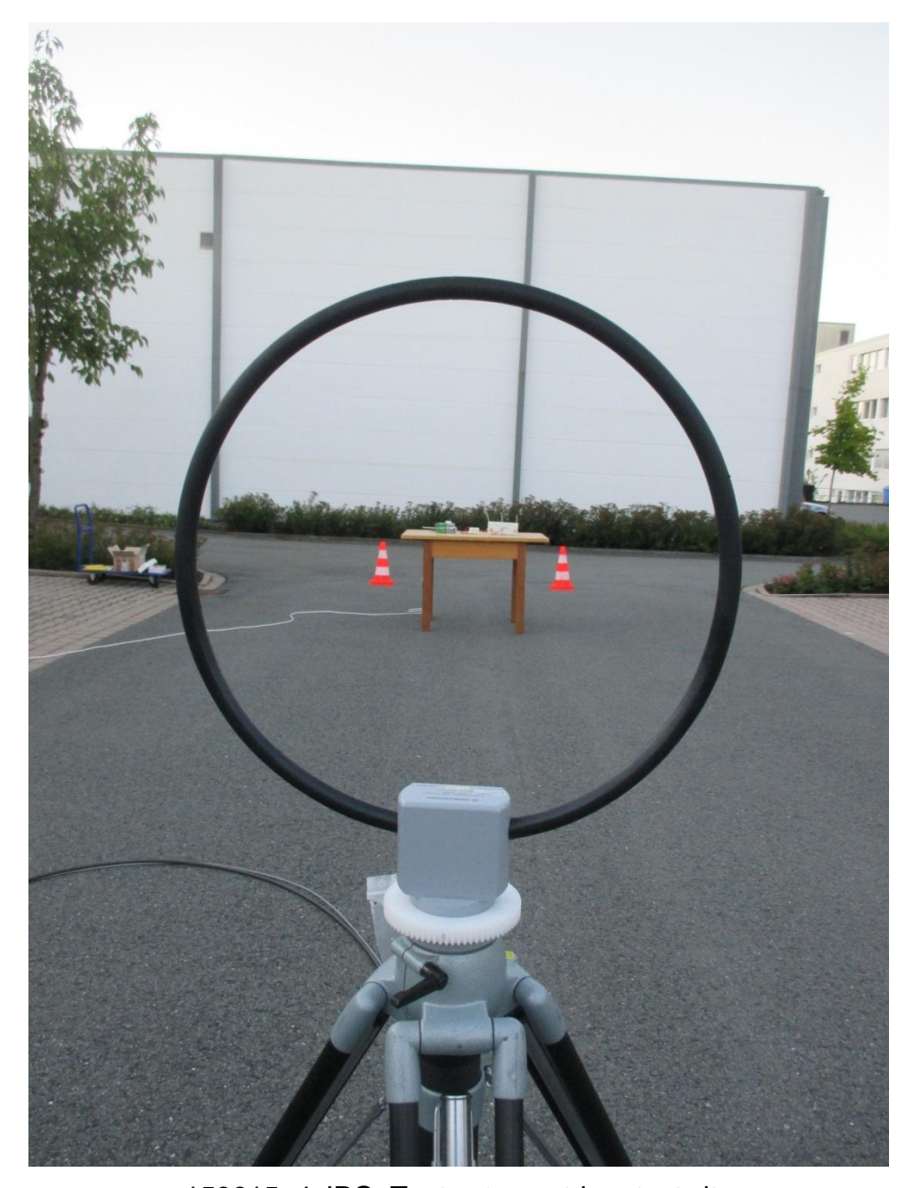
153615_4.JPG: Test setup outdoor test site

Test Report No.: F153615E1 2<sup>nd</sup> version Order No.: 15-113615