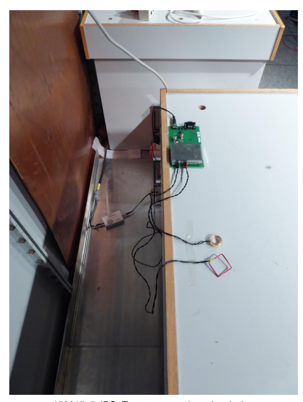
153615_5.JPG: Test setup conducted emission

Test Report No.: F153615E1 2<sup>nd</sup> version Order No.: 15-113615 Examiner: Manuel BASTERT Date of issue: 05/16/2017