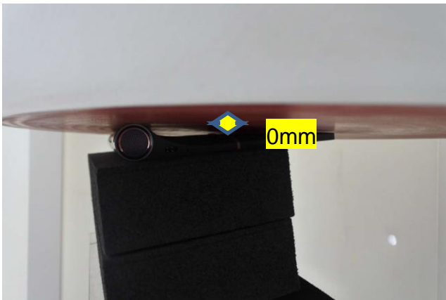
Bottom Face of EUT with Phantom 0 mm Gap