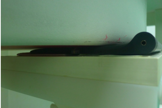
Bottom Face, Test Separation 0 cm