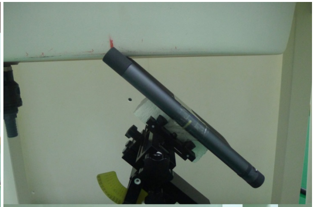
Curved surface of Edge3 Tilted 40°