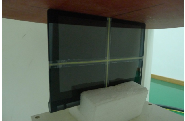
Edge2, Test Separation 0 cm