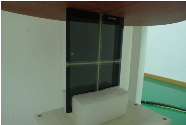
Edge3, Test Separation 0 cm