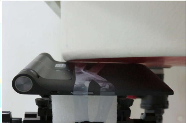
Curved surface of Edge2