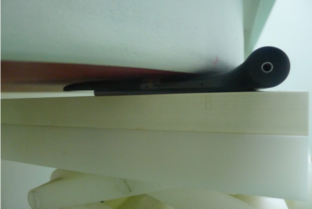
Bottom Face, Test Separation 0 cm