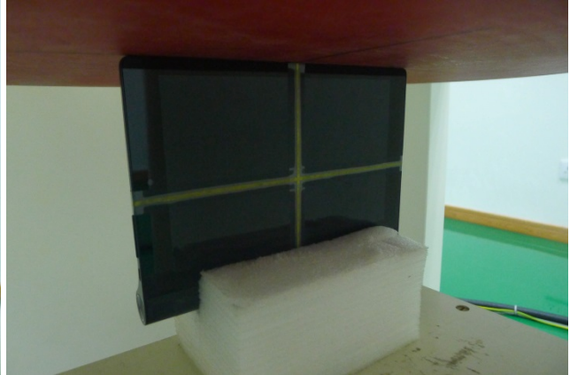
Edge1, Test Separation 0 cm