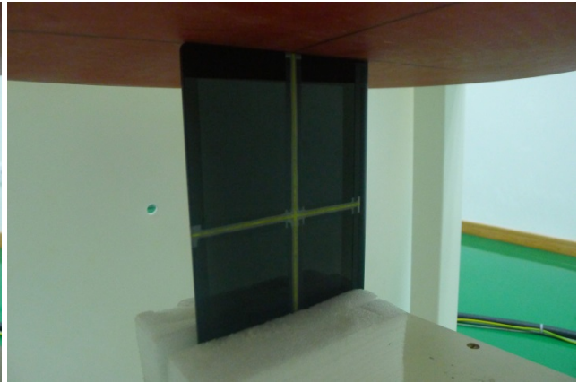
Edge2, Test Separation 0 cm