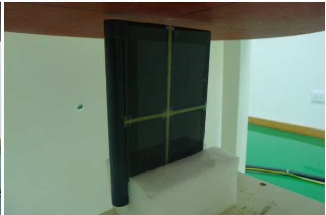
Edge4, Test Separation 1.2 cm