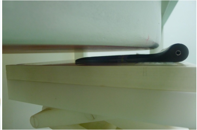
Bottom Face, Test Separation 1.2 cm