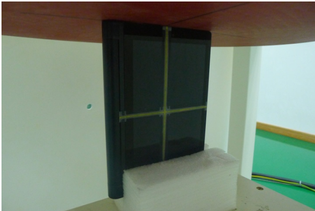
Edge4, Test Separation 0 cm