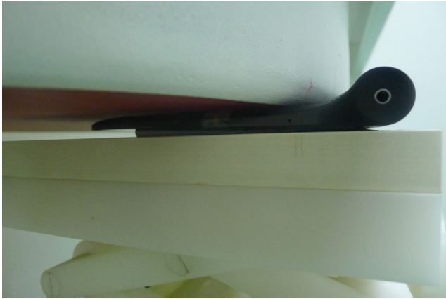
Bottom Face, Test Separation 0 cm