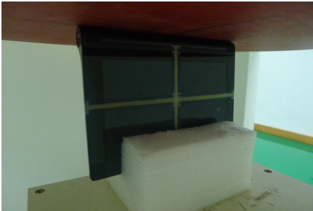
Edge3, Test Separation 0 cm