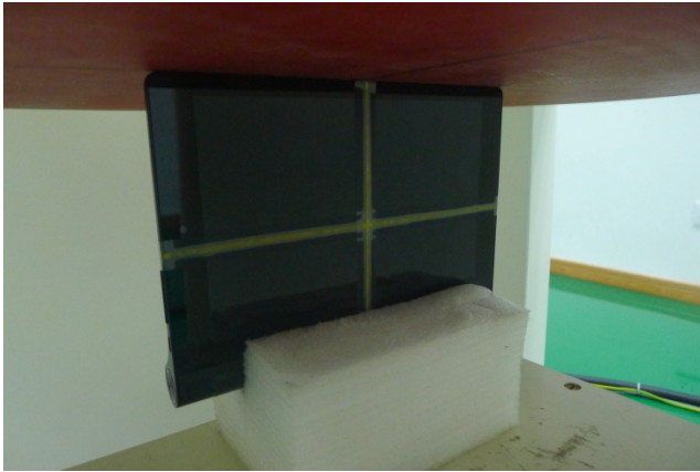
Edge1, Test Separation 0 cm