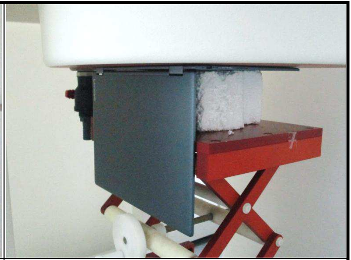
Rear Face of Keyboard_Degree90 with 0 cm Gap