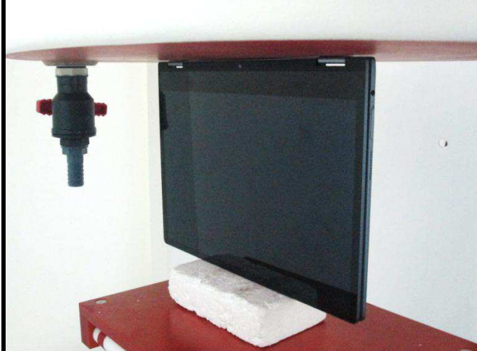
Top Side of Keyboard_Degree360 with 0 cm Gap