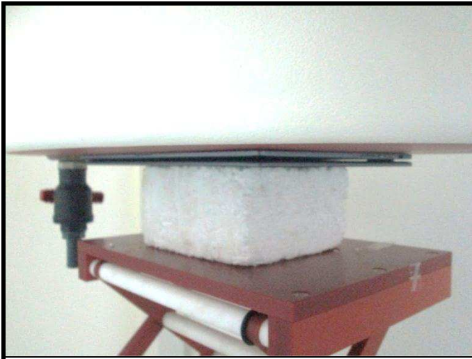
Front Face of Keyboard_Degree360 with 0 cm Gap