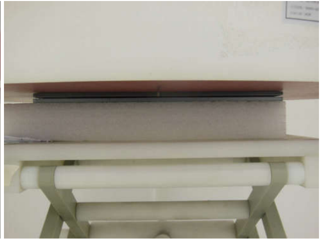
Bottom Face, Test Separation 0 mm