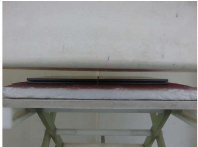
Bottom Face, Test Separation 18 mm