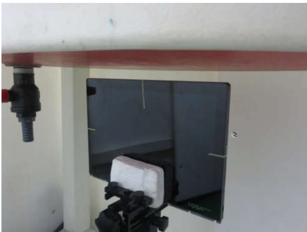
Edge1, Test Separation 18 mm