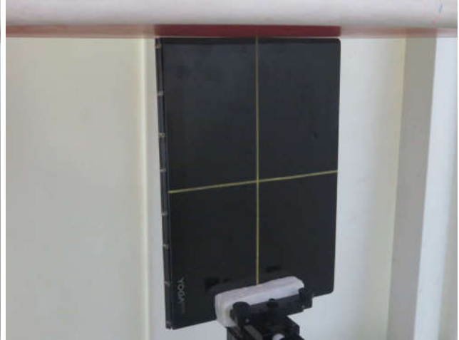
Edge4, Test Separation 0 mm