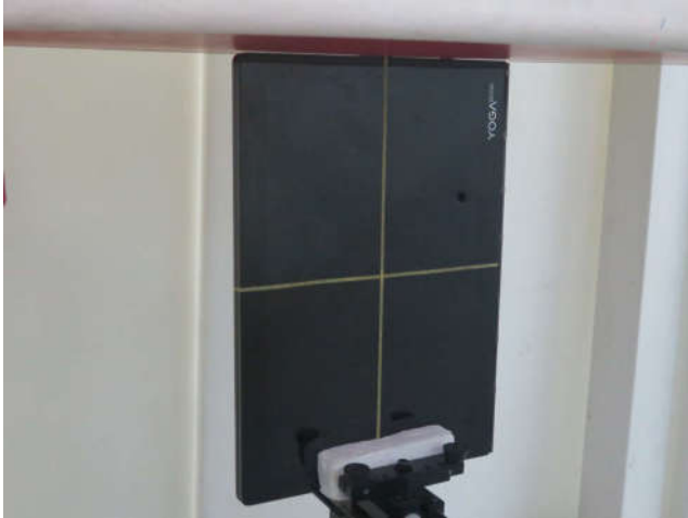
Edge2, Test Separation 0 mm