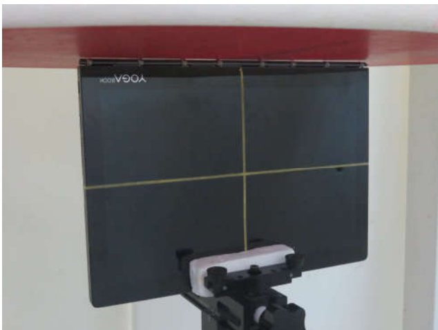
Edge3, Test Separation 0 mm