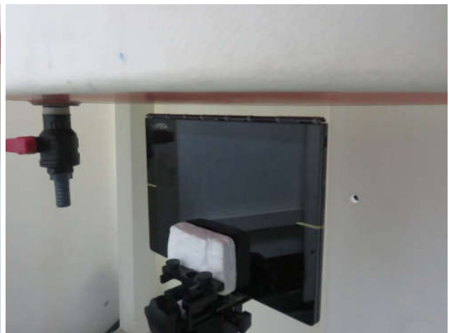
Edge3, Test Separation 10 mm