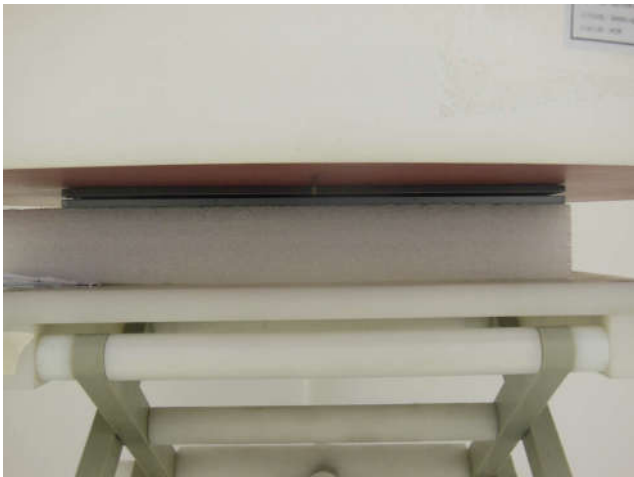
Bottom Face, Test Separation 0 mm