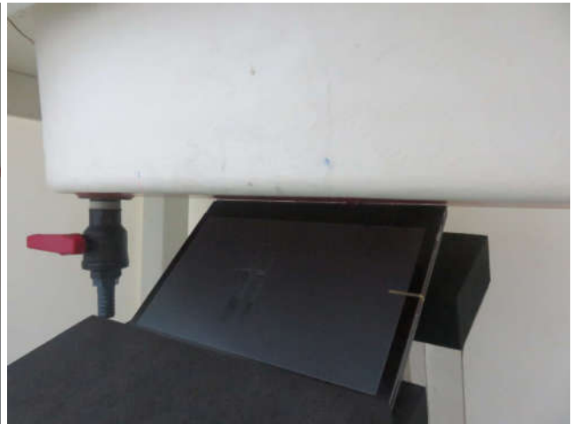
Curved Surface of Edge3, Test Separation 0 mm