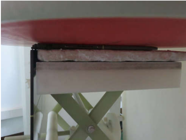
Bottom, Test Separation 0 mm