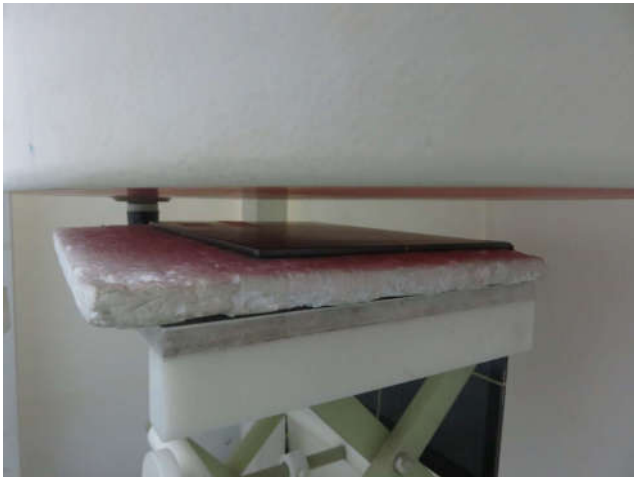
Back of Display Screen, Test Separation 25 mm