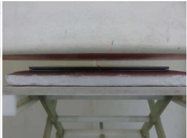
Bottom Face, Test Separation 10 mm