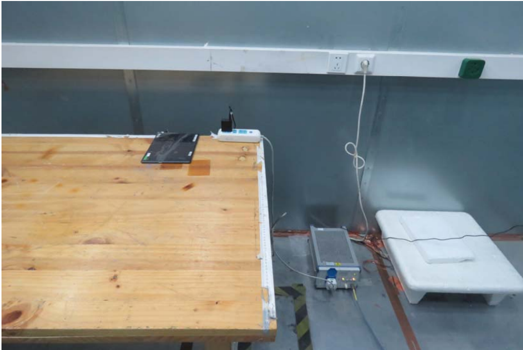
Picture 3 Conducted Emission Test Setup