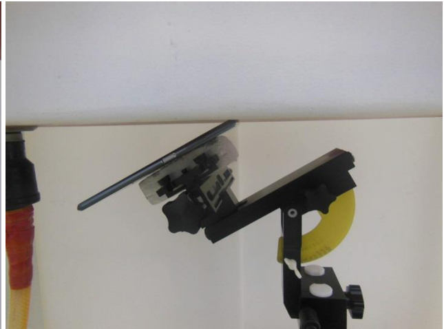
Curved Surface of Edge1, Test Separation 0 mm