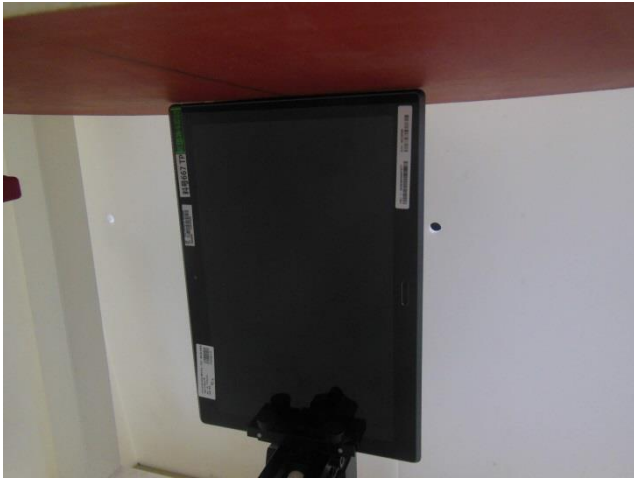
Edge2, Test Separation 0 mm