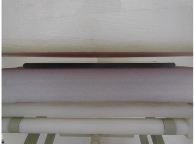
Bottom Face, Test Separation 12mm