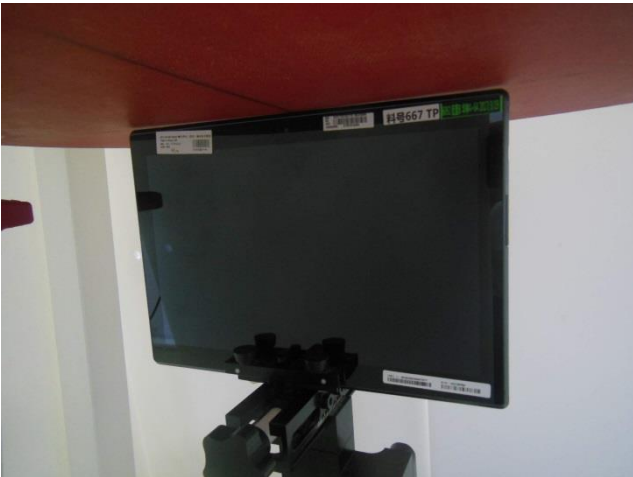
Edge1, Test Separation 0 mm