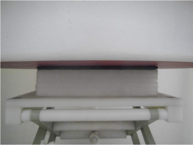
Bottom Face, Test Separation 0 mm