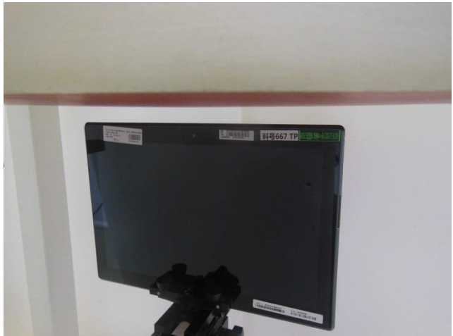
Edge1, Test Separation 14 mm