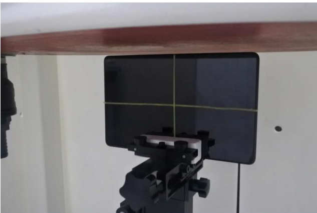
Edge 4 of EUT with Phantom 10 mm Gap