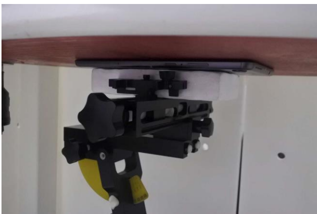
Bottom Face of EUT with Phantom 0 mm Gap