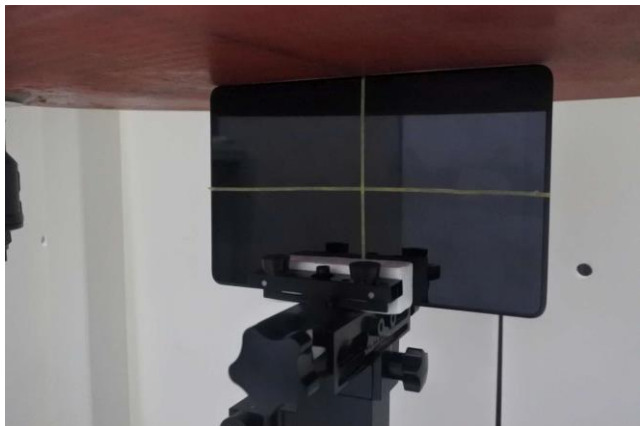
Edge 4 of EUT with Phantom 0 mm Gap