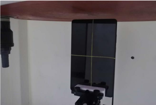
Edge 1 of EUT with Phantom 12 mm Gap