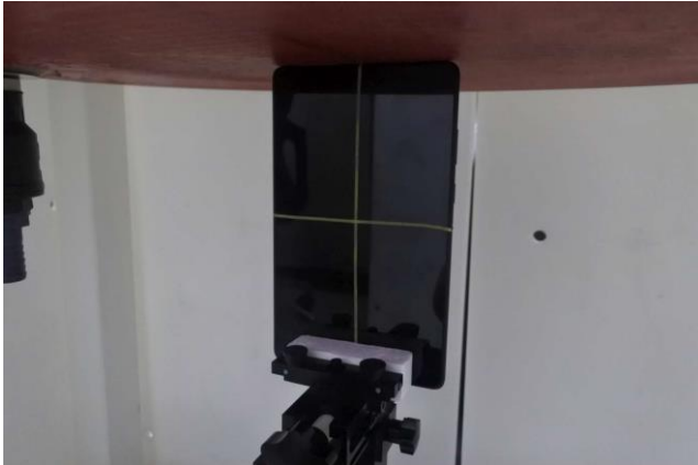
Edge 1 of EUT with Phantom 0 mm Gap