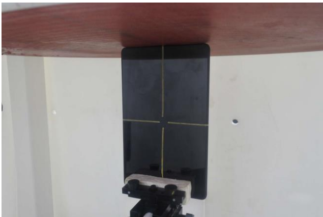
Edge 3 of EUT with Phantom 0 mm Gap