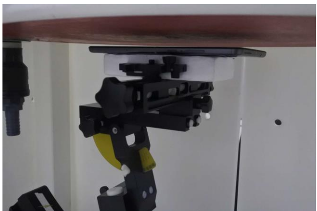
Bottom Face of EUT with Phantom 13 mm Gap