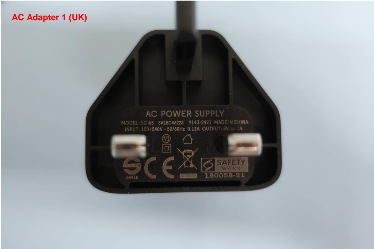
AC Adapter 1 (UK)

Brand Name: Lenovo / Model Name: Lenovo TB-8505X