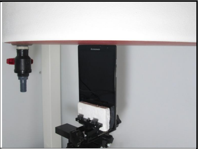
Top Side of EUT with 0 cm Gap