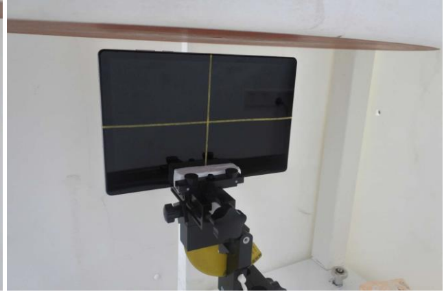
Edge 2 of EUT with Phantom 16 mm Gap (Sensor off)