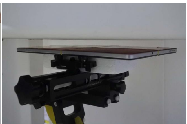
Bottom Face of EUT with Phantom 15 mm Gap (Sensor off)