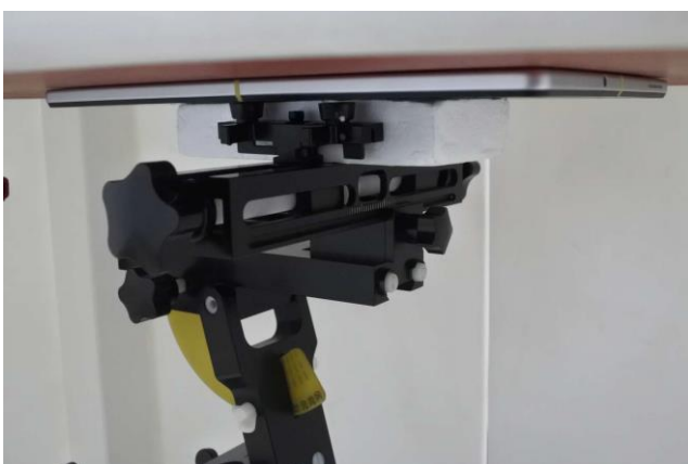
Bottom Face of EUT with Phantom 0 mm Gap