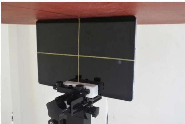
Edge 4 of EUT with Phantom 0 mm Gap