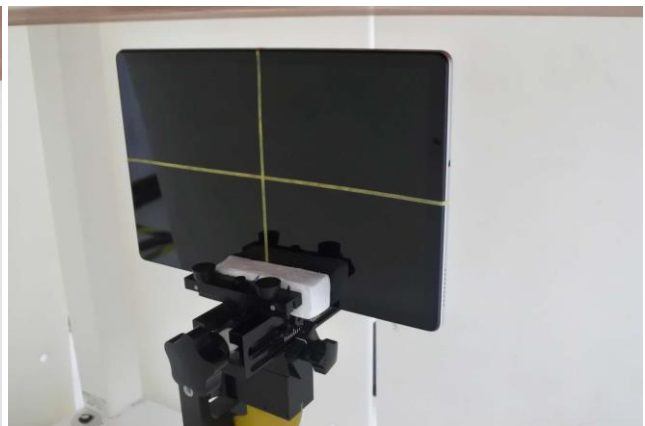
Edge 4 of EUT with Phantom 22 mm Gap (Sensor off)