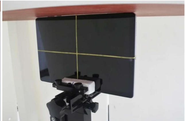
Edge 2 of EUT with Phantom 0 mm Gap