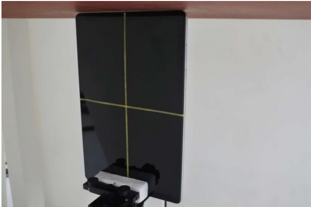
Edge 1 of EUT with Phantom 0 mm Gap