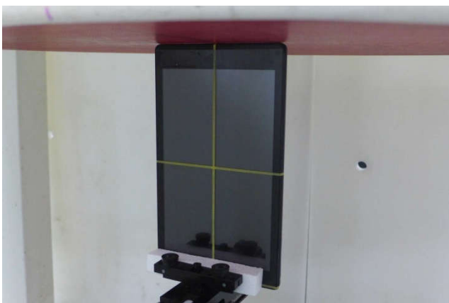
Edge3, Test Separation 0 cm