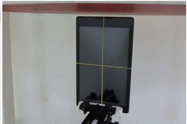
Edge3, Test Separation 0.8 cm