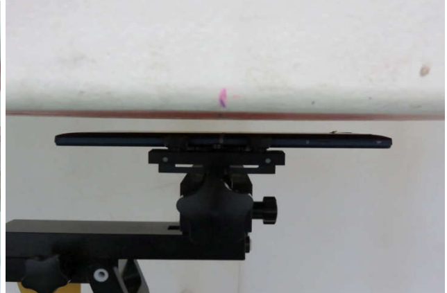
Bottom Face, Test Separation 1.0 cm