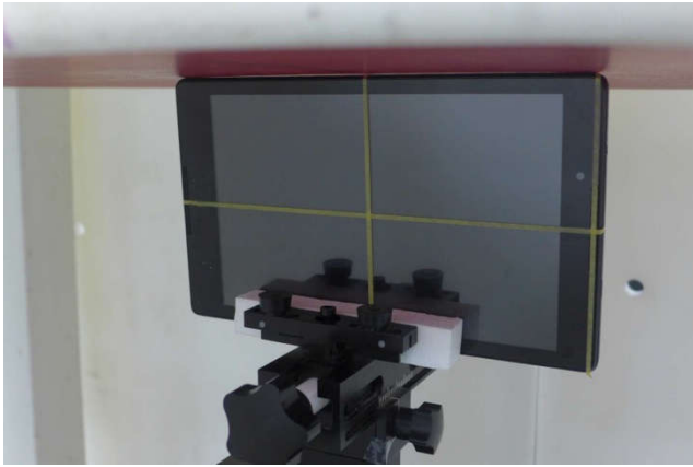
Edge4, Test Separation 0 cm