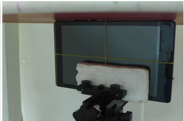
Edge2, Test Separation 0 cm