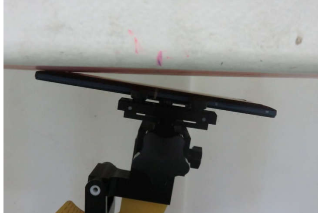
Curved Surface of Edge3