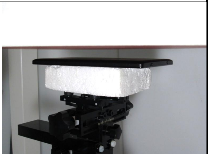
Rear Face of EUT with 13 mm Gap