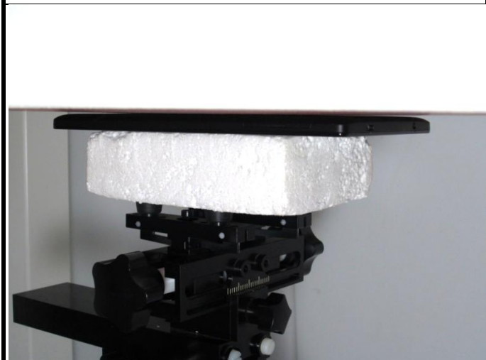
Rear Face of EUT with 0 mm Gap