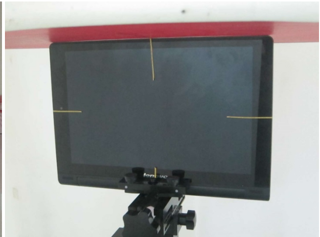
Edge1, Test Separation 0 cm