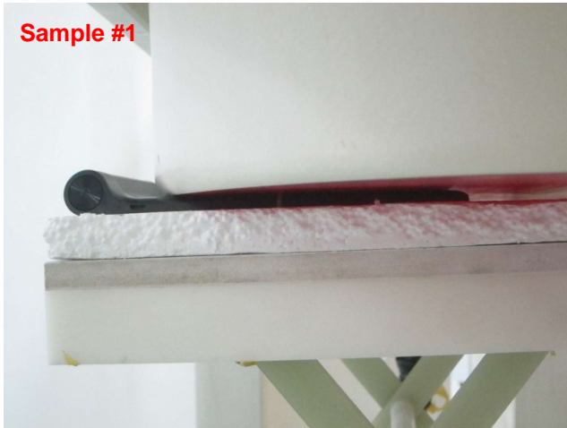
Bottom Face of Tablet with Phantom 0 cm Gap