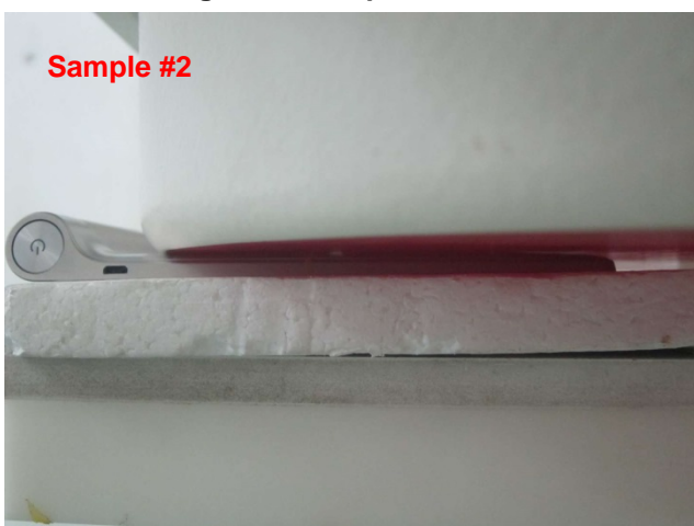
Bottom Face of Tablet with Phantom 0 cm Gap