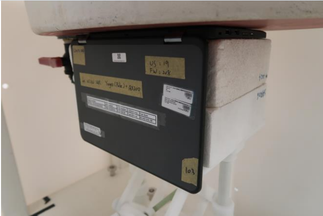
Bottom of Laptop, Test Separation 0 mm