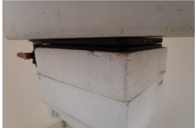
Bottom Face, Test Separation 0 mm