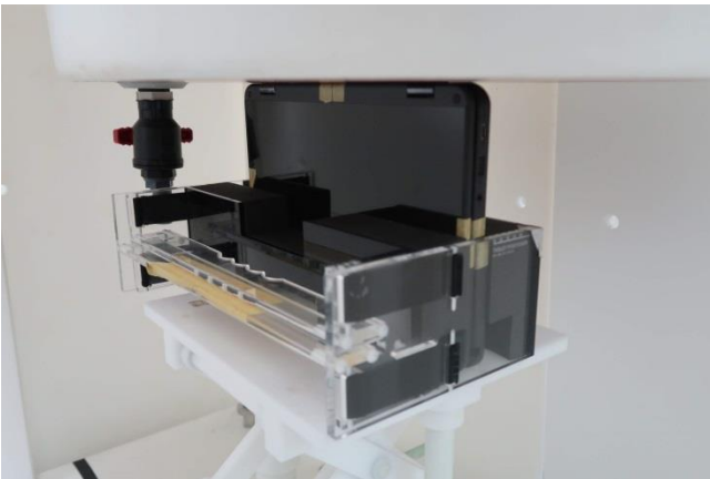
Edge3, Test Separation 0 mm