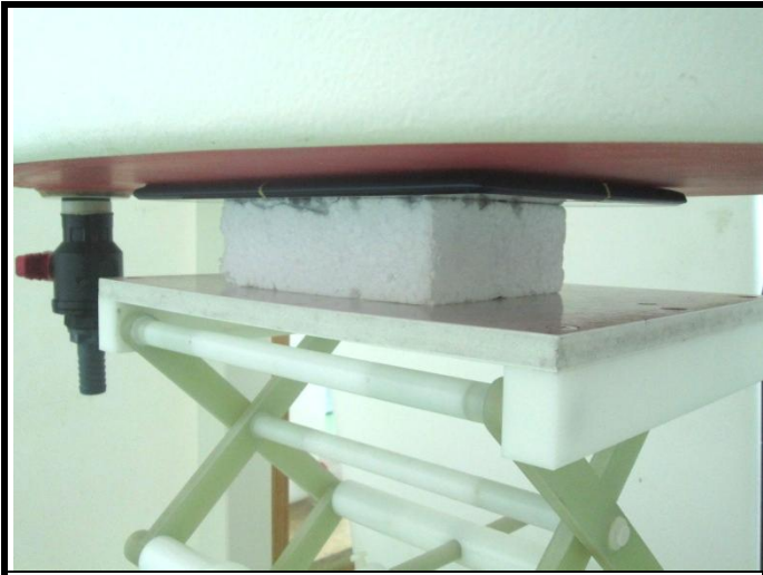
Rear Face of EUT with 0 mm Gap