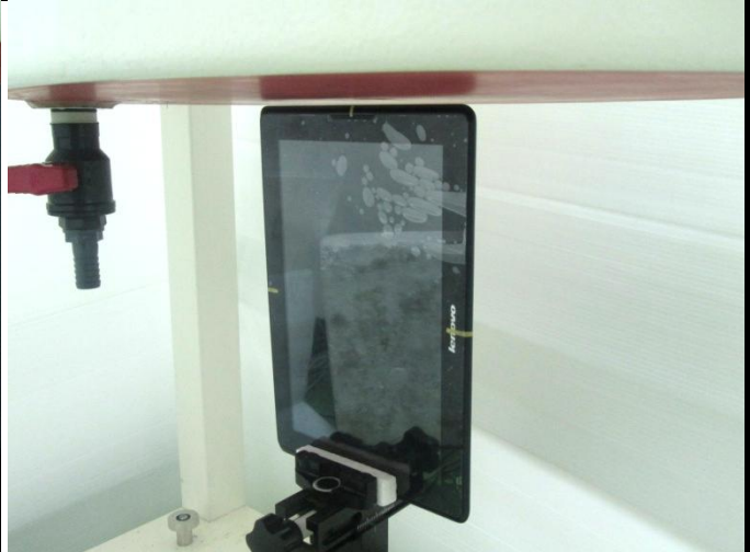
Right Side of EUT with 2 mm Gap