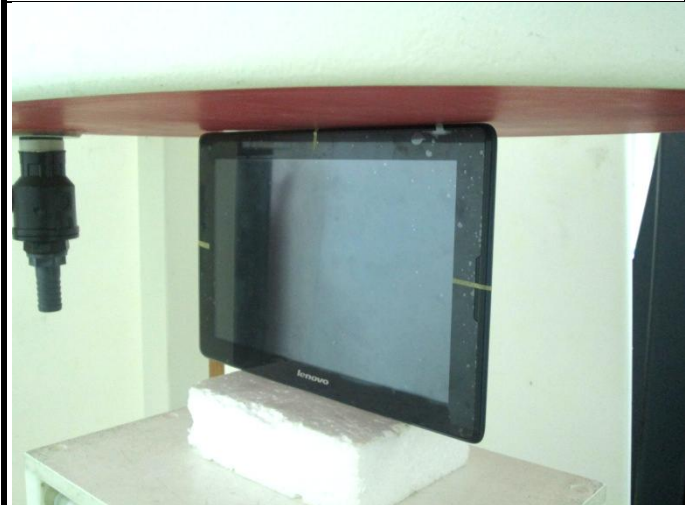
Top Side of EUT with 0 mm Gap