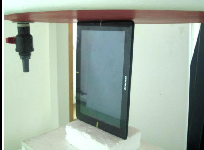
Right Side of EUT with 0 mm Gap