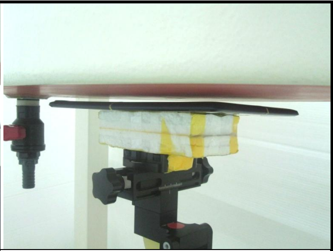
Rear Face of EUT with 6 mm Gap