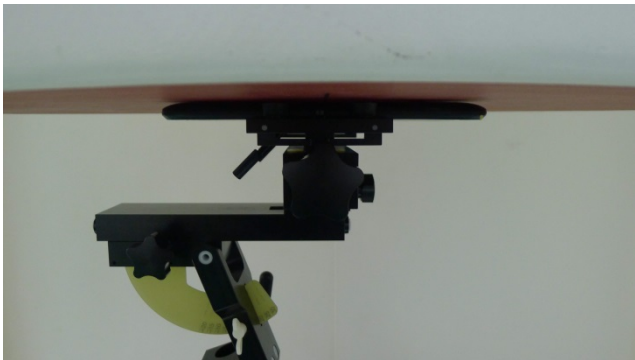
Bottom Face, Test Separation 0 cm