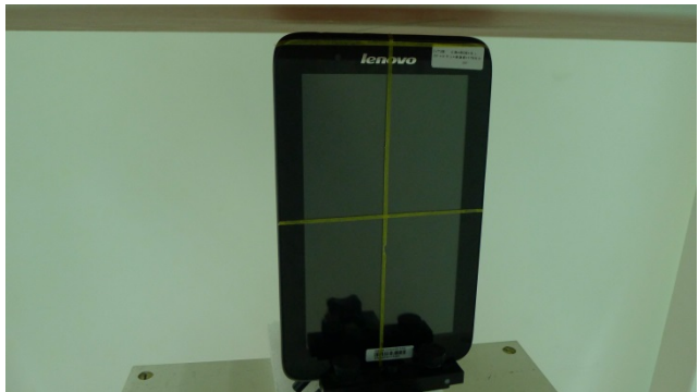
Edge1, Test Separation 0.4 cm