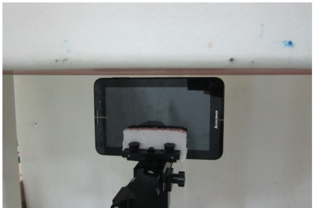
Edge 2 with Phantom 0.7 cm Gap