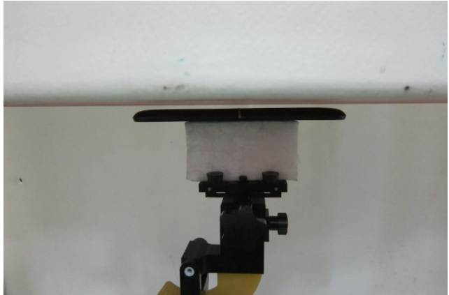
Bottom Face of Tablet with Phantom 0.7 cm Gap