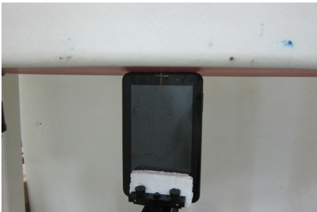
Edge 1 with Phantom 0 cm Gap