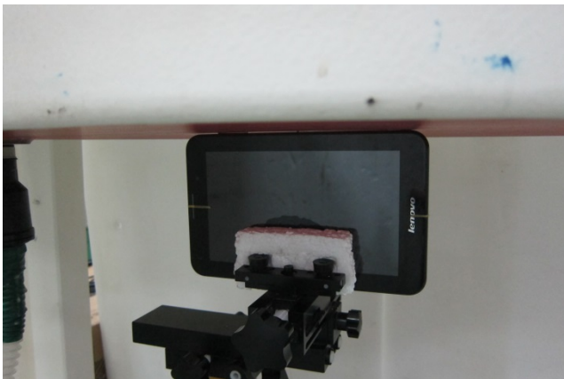
Edge 2 with Phantom 0 cm Gap