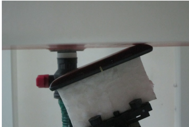
Curved surface of Edge2 with Phantom 0 cm Gap