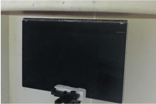
Edge 3, Test Separation 9 mm