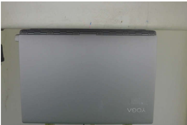
Bottom, Test Separation 0 mm