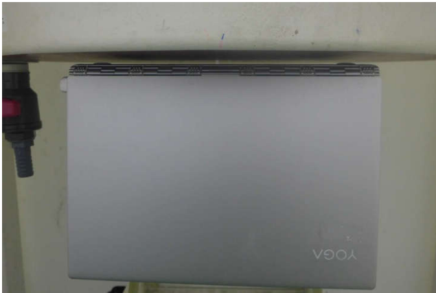
Bottom, Test Separation 7 mm