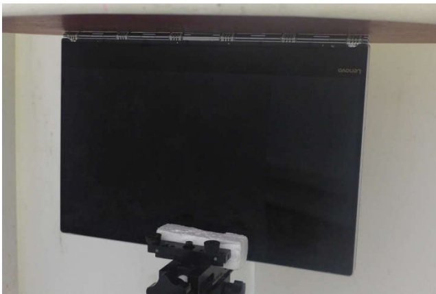
Edge 3, Test Separation 0 mm