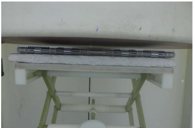
Bottom Face, Test Separation 5 mm