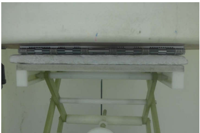
Bottom Face, Test Separation 0 mm