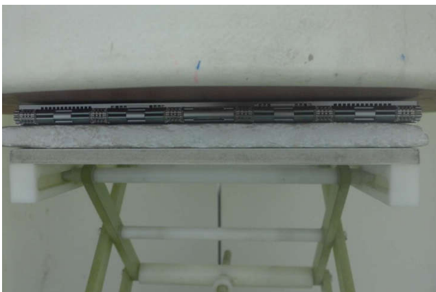
Bottom Face, Test Separation 1 mm