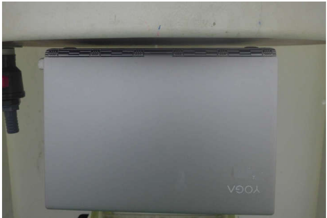
Bottom, Test Separation 5 mm