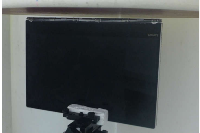
Edge 3, Test Separation 5 mm