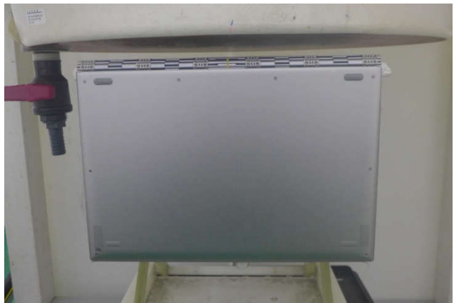
Back of Panel, Test Separation 25 mm