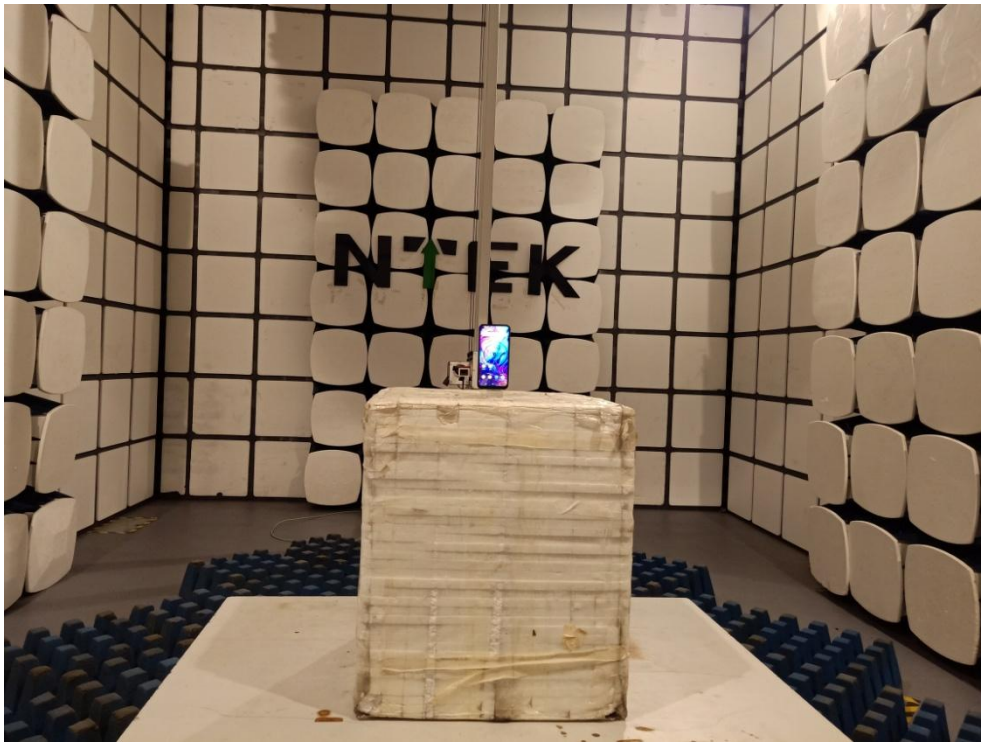
AC Conducted Measurement Photos