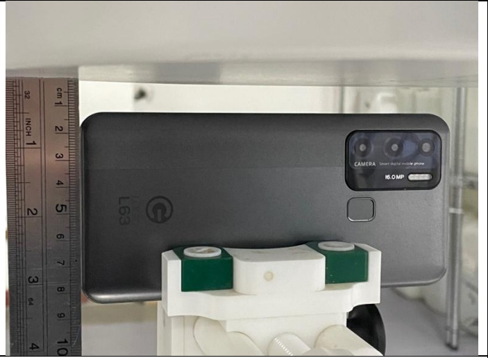
Right Side (Separation distance of 10mm)