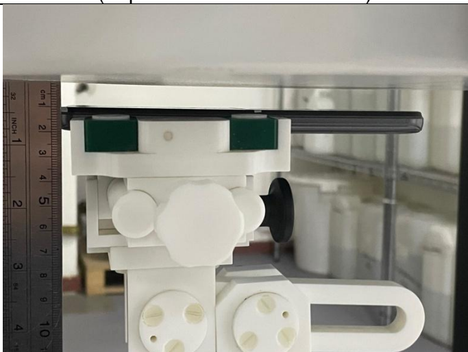
Front Side (Separation distance of 10mm)