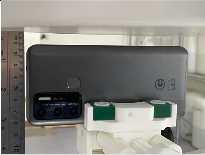
Left Side (Separation distance of 10mm)