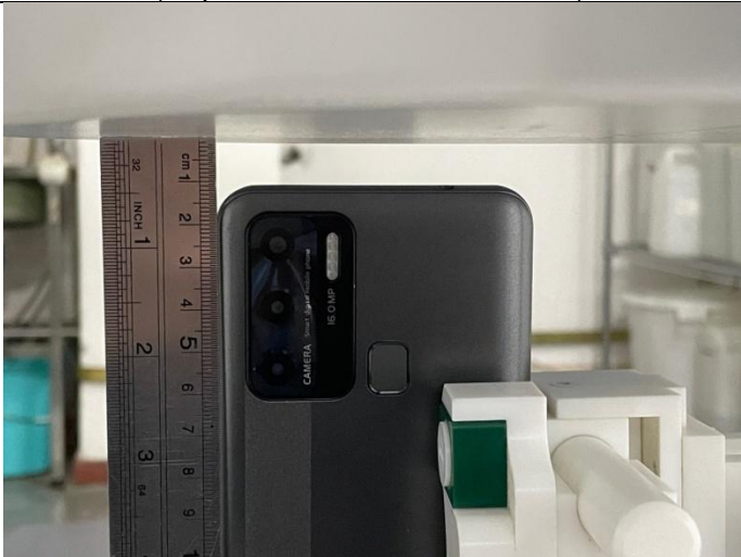
Top Side (Separation distance of 10mm)