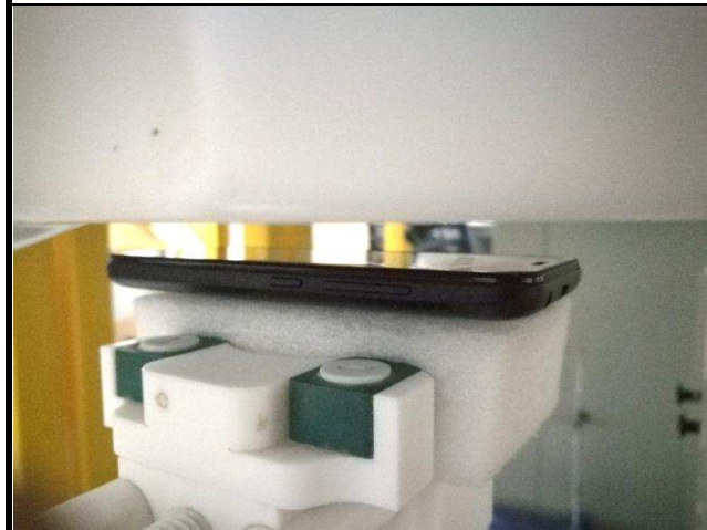
Front Face of EUT with 1.0 cm Gap