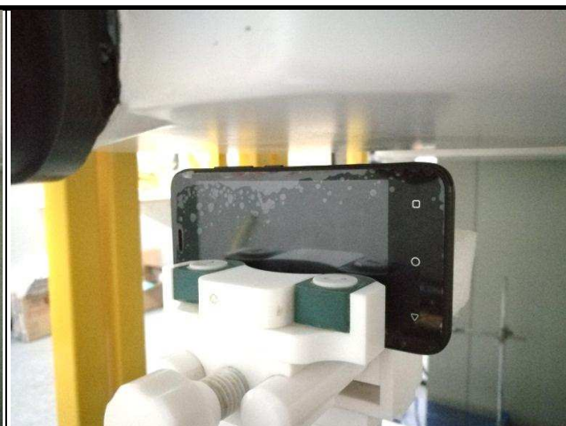
Right Side of EUT with 1.0 cm Gap