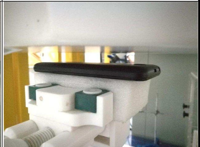
Rear Face of EUT with 1.0 cm Gap