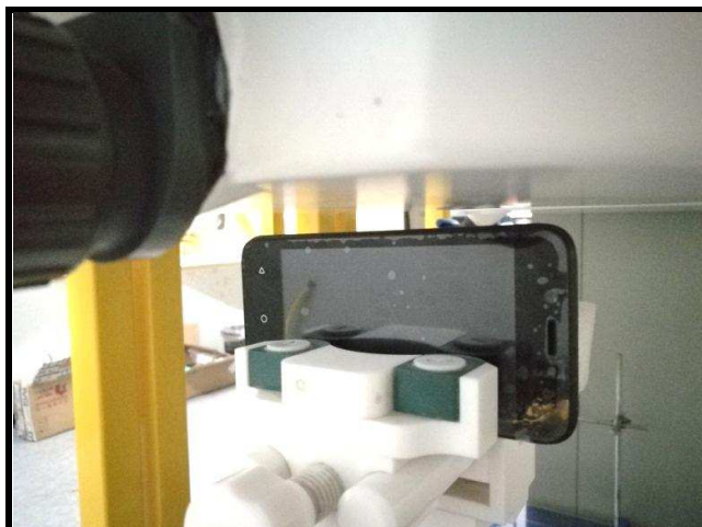
Left Side of EUT with 1.0 cm Gap