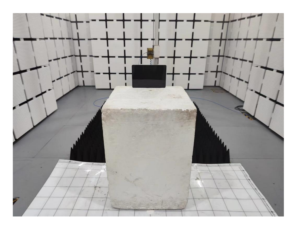
Set-up for Radiated Spurious Emission, Above 1GHz