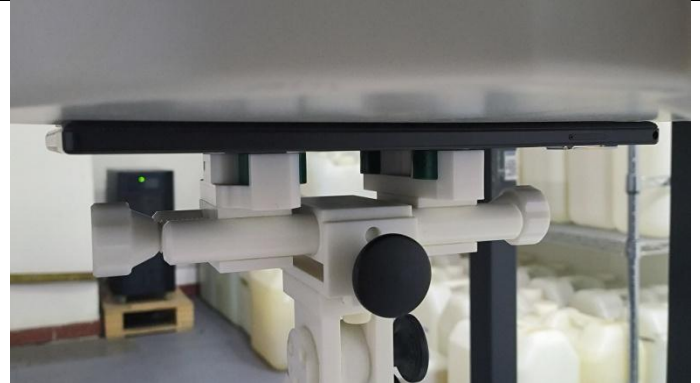
Back Side (Separation distance of 0mm)