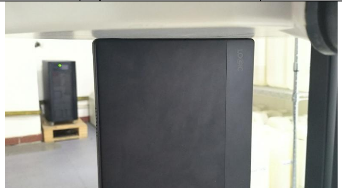
Right Side (Separation distance of 0mm)