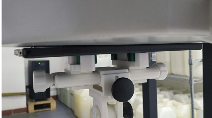
Front Side (Separation distance of 0mm)