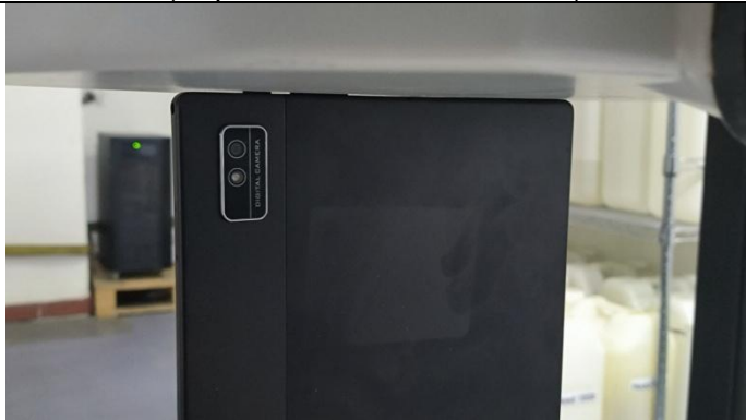
Left Side (Separation distance of 0mm)