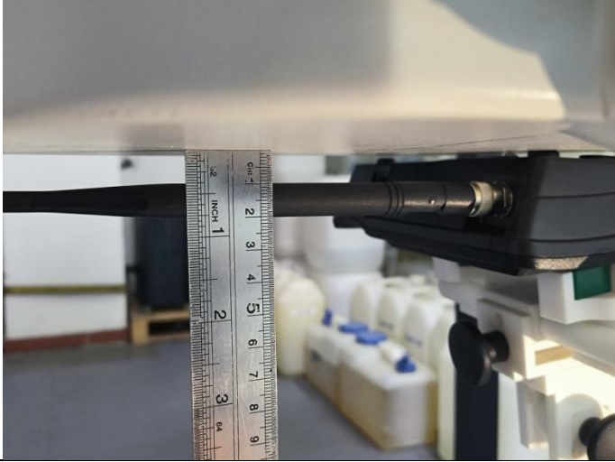
Back Side and Ant Horizontal (Separation distance of 10mm)