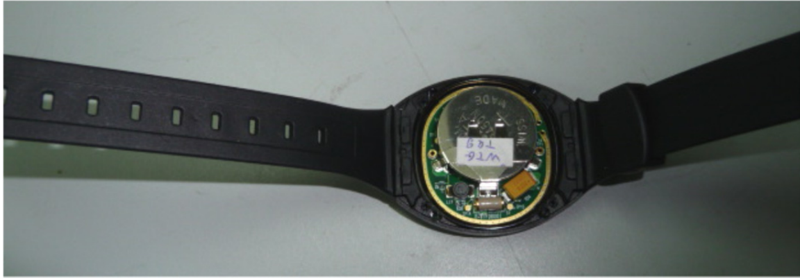
Photograph No.1 Quad Technology Wrist Tag internal view