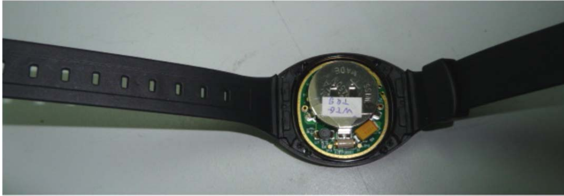
Photograph No.1 Triple Technology Wrist Tag internal view