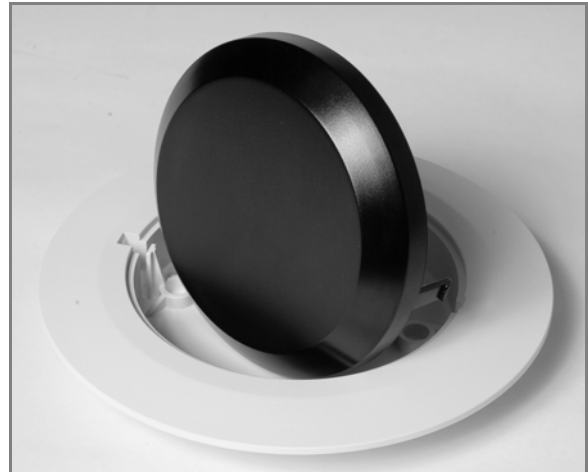
Elpas2 High-Definition IR Reader

The Elpas2 High-Definition IR Reader also supports XML messaging technology via the Elpas2 RF Ethernet Reader for integration with external systems plus RS-485 data transmission with up to 15 other Elpas2 IR readers.