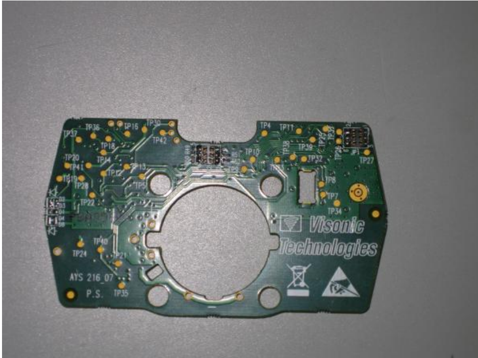
Bottom of Secondary PCB