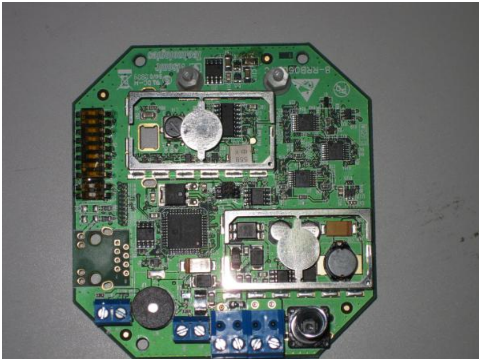
PCB with secondary with component covers removed