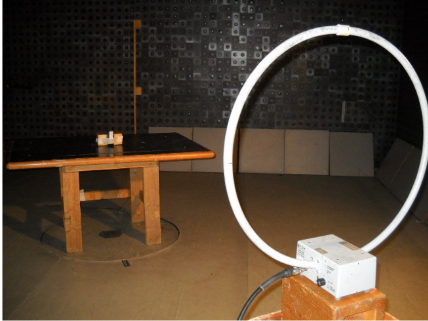
Photograph No.1 Setup for spurious emission field strength measurements in the anechoic chamber below 30 MHz