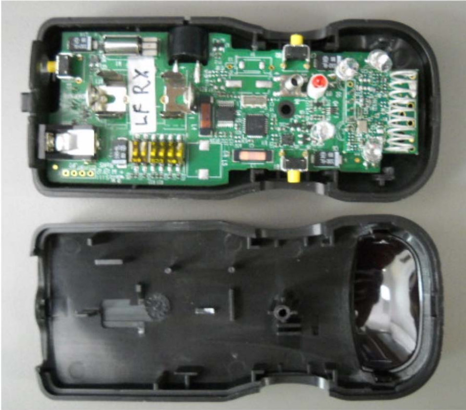
Photograph No.1 Man-down tag internal view