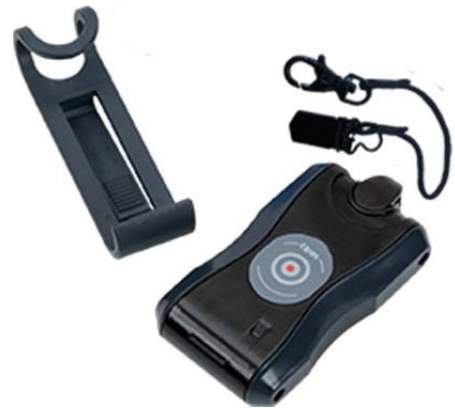
(Actual product may vary from photo)

The same Elpas infrastructure used for the duress solution may also be leveraged for Access control, Asset tracking, Attendance and intrusion alarming making Elpas one of the most competitive comprehensive solutions available today.