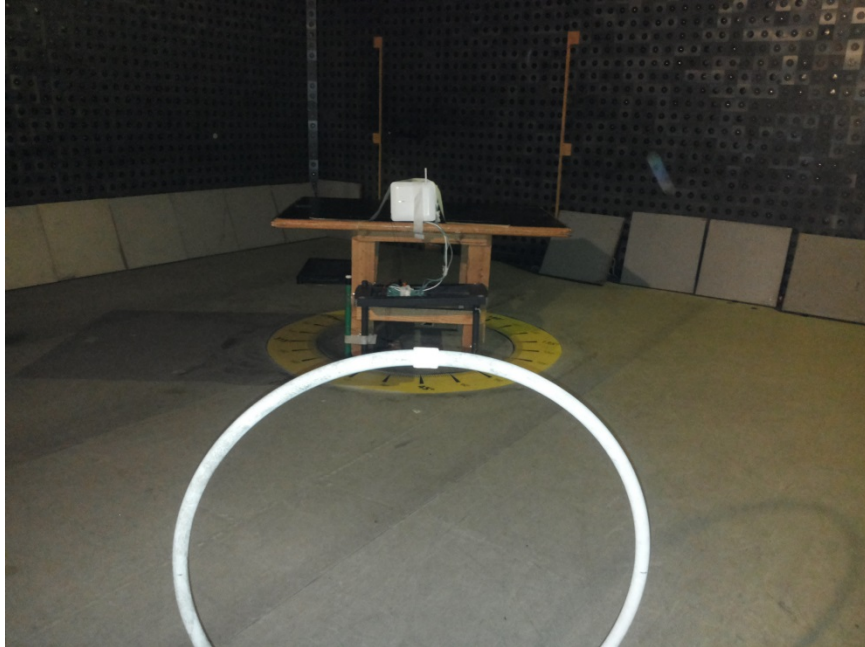
Photograph No.1 Setup for spurious emission field strength measurements in the anechoic chamber below 30 MHz