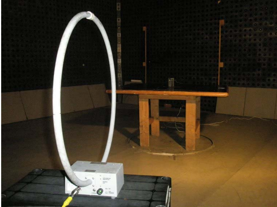
Photograph No.1 Setup for carrier and spurious emission field strength measurements in the anechoic chamber below 30 MHz