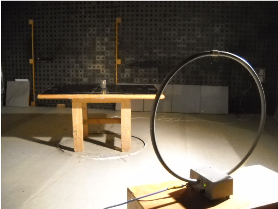
Photograph No.1 Setup for carrier and spurious emission field strength measurements in the anechoic chamber below 30 MHz