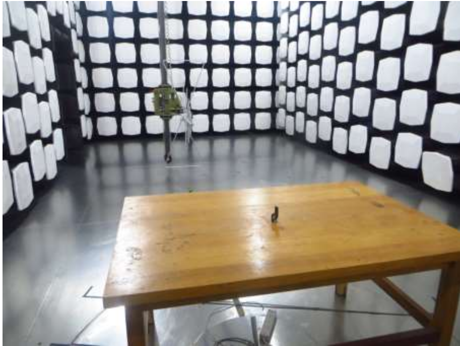
Below 1 GHz