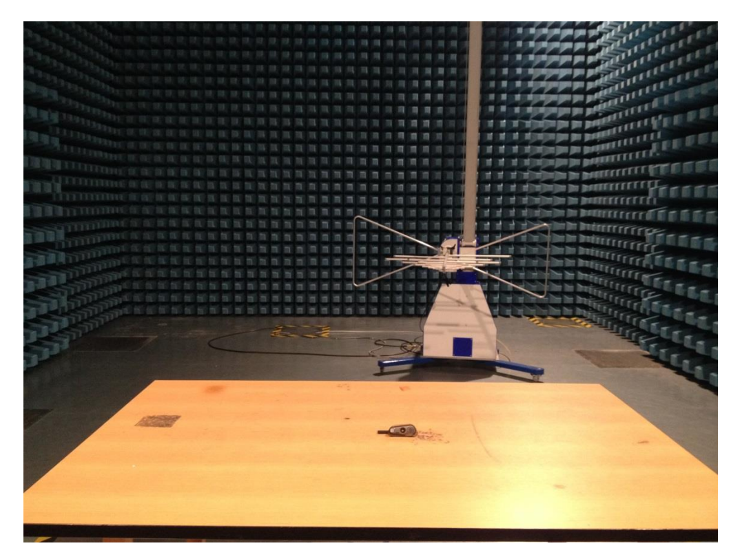
Below 1 GHz