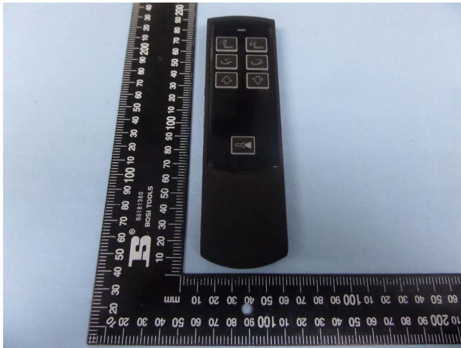
EUT View 11(Model: RF334-7)