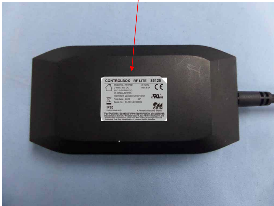
FCC ID Label Location