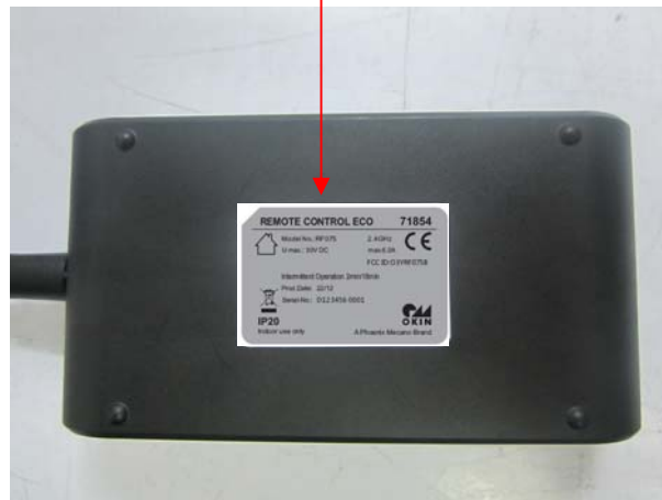
FCC ID Label Location