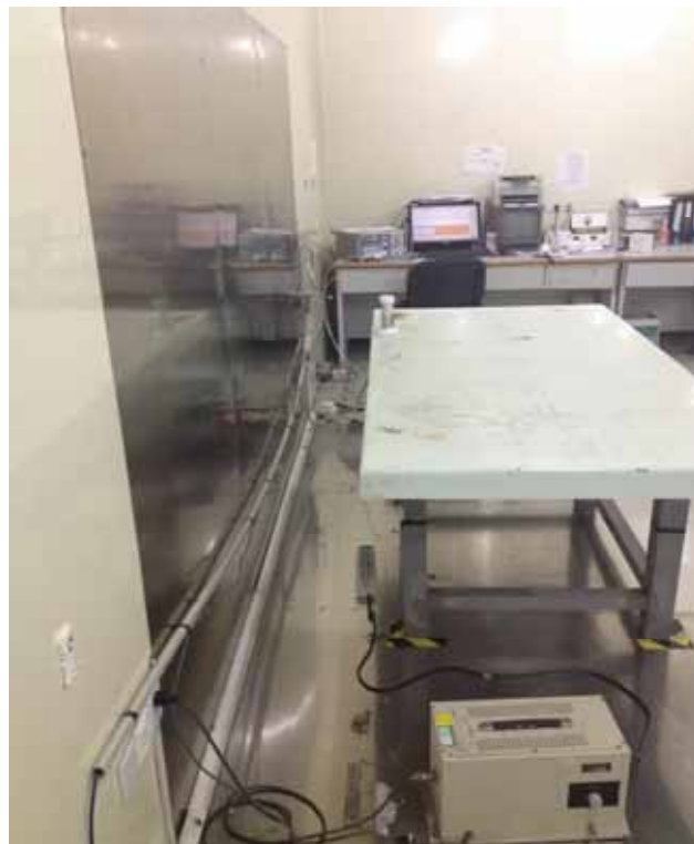
Side View of Conducted Disturbance Measurement