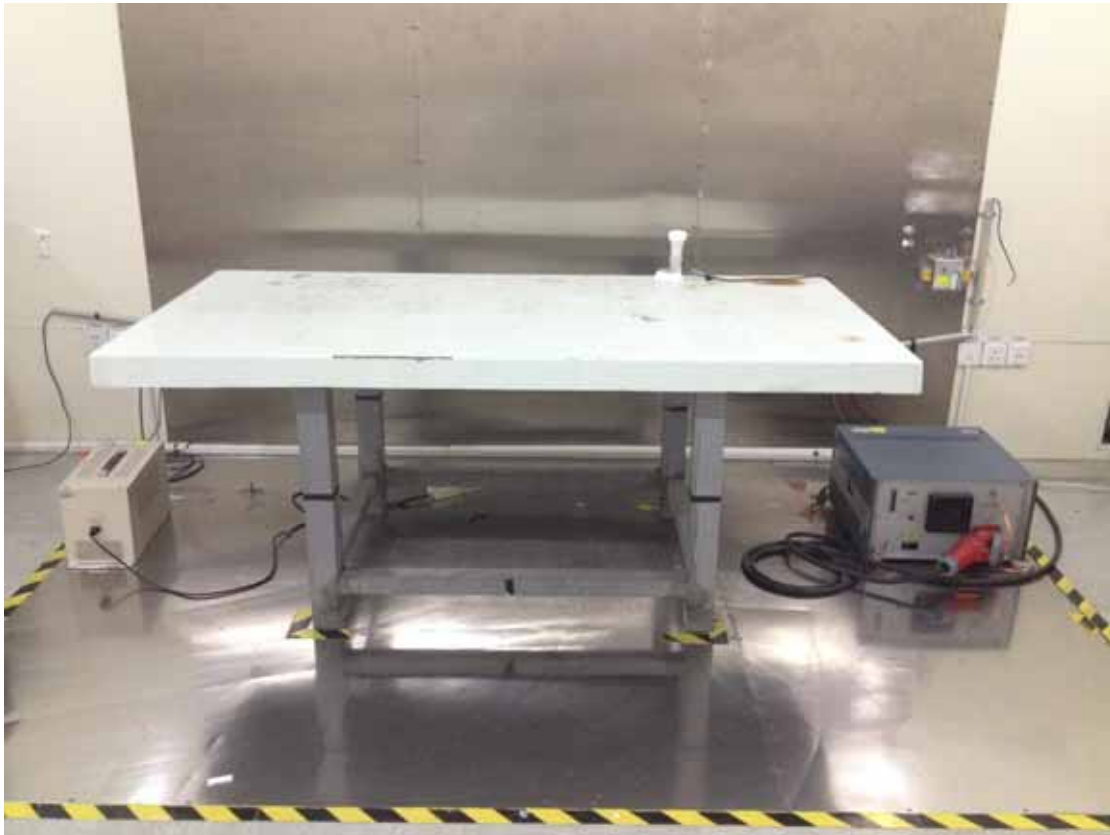
Front View of Conducted Disturbance Measurement